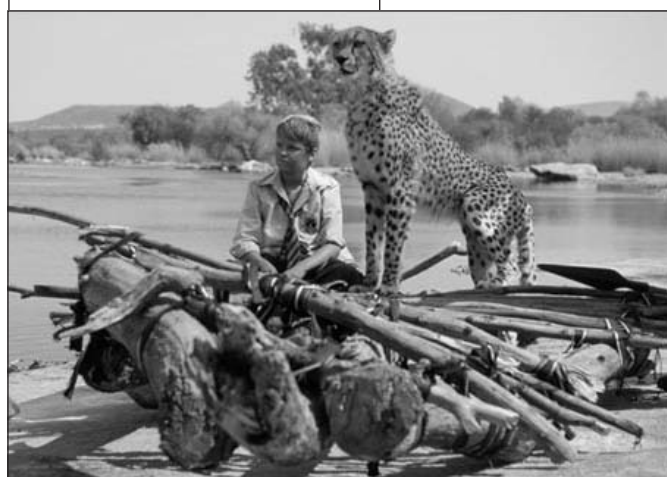
A scene from Duma

films. The first one, in the fall (date to be confirmed) will be Duma , a South African film about a young boy and his pet cheetah. In the spring for Ascension Day, we have chosen a Canadian film, Eve and the Fire Horse . Check the bulletin for more information about these films closer to the dates.