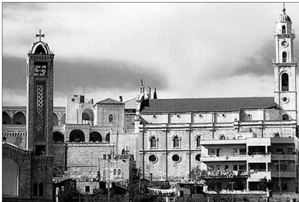
Day 7 - Bethlehem