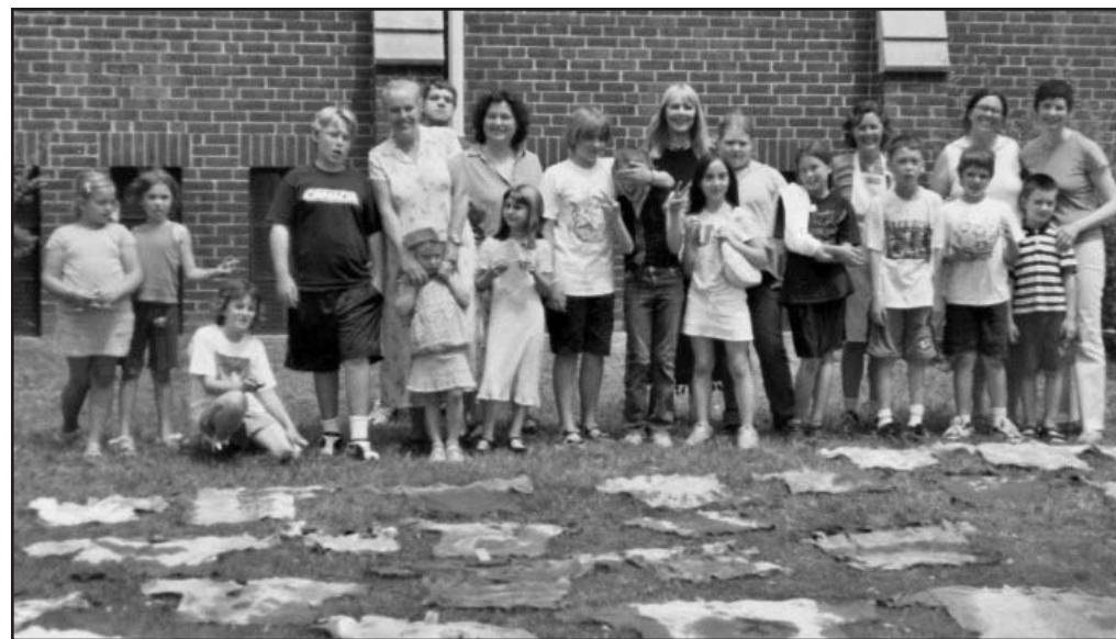
The year end party was a tie-dye extravaganza!

So mark you calendars now. Reserve or buy you tickets early to avoid disappointment. This will undoubtedly be the highlight of St. Olave's fall social events!